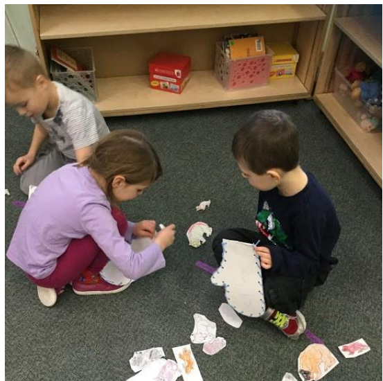
Practicing story retelling