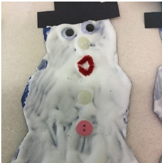
Shaving Cream Snowman

Police Information Check (PIC) – If you do not have an up to date PIC and would like to obtain one, please send an email to dcakids@telus.net and we will provide you with a letter to take to the police station.